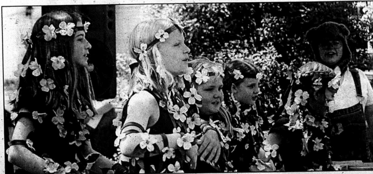
A flower girl chorus added a spring touch to the children's play, "Goldilocks and the Three Bears on the Square." Papa Bear looks on.